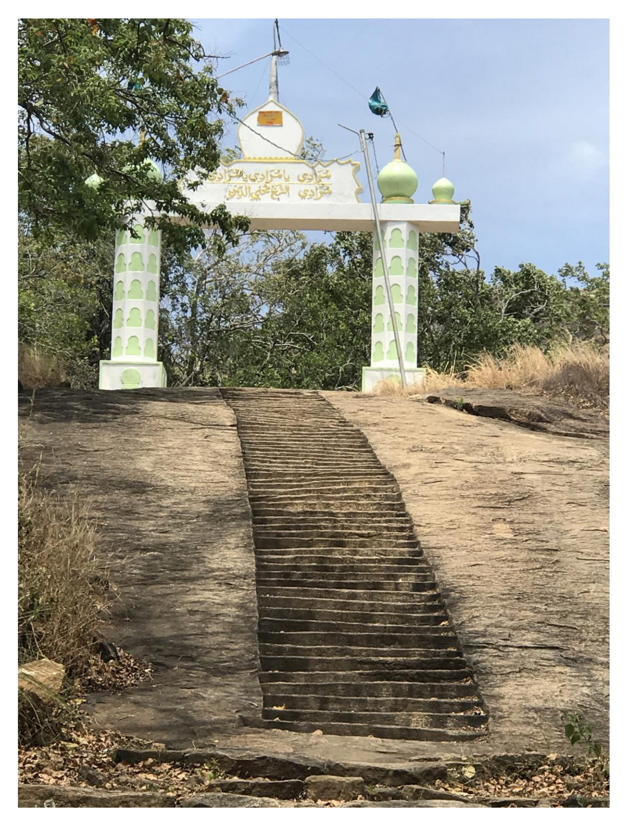
Fig 2: The Muslim 'Torana' beside the rock-cut steps to Kuragala

Muslim names, is through a large white entrance arch with green minarets on either side. This flamboyant arch, with Islamic motifs, was constructed in 1982 (Aboosally 2002: 64). Some local residents identify this new construction as a "Muslim Torana", (Figure 2) the latter being a specific religious emphasis and designation usually associated with Buddhist sites.