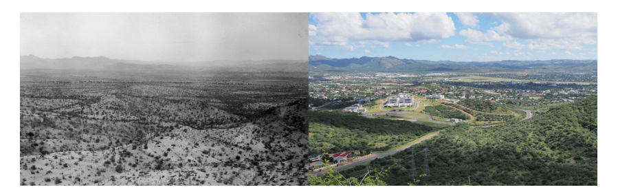
Fig. 10. Windhoek southern suburbs, looking south-west from Wassenberg. Matched photographs spanning 1919 (left) to 2014 (right). Bush thickening is evident throughout the landscape, not to mention the sprawl of urban residential housing and the new Presidential Palace built by a North Korean company, completed in 2008.

Other repeat image pairs from this collection show the development of towns and settlements, such as in the open uninhabited savanna of central Namibia, now dominated by the Presidential Palace and the extensive southern suburbs of the capital, Windhoek: as shown in Figure 10.