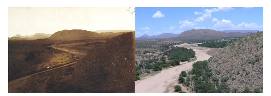
Fig. 9. River Skaap, Hatsemas Central Highlands, central Namibia. Matched photographs spanning 1876 (left) to 2005 (right). Camelthorn individuals have colonised previously bare or sparsely vegetated river terraces, probably in a single recruitment event. The increase in small trees and shrubs on the rocky pediments and hill slopes is indicative of regional bush encroachment patterns. For scale, note the white tent and ox-wagon of the Palgrave expedition at the bottom left quadrant of the 1876 image.

In 1876 the grazing lands of central Namibia were more grassy and less woody; rangelands were highly shaped by large pastoral herds, transhumance routes, temporary settlements and the use of fire to manage grasslands. During the 1890s, however, several cataclysmic events converged to bring about radical change. These included the rinderpest epizootic of especially 1897, smallpox, and a colonial war of the German state against autochthonous Namibians that intensified in 1904–1907, all of which effectively decimated indigenous peoples and their herds (Esterhuyse 1968; Olusoga and Erichsen 2010; Wallace 2011). As illustrated in Figure 9, the resulting hiatus in land use resulted in ecological changes that persist in the landscape today as a signature of events of a century ago.