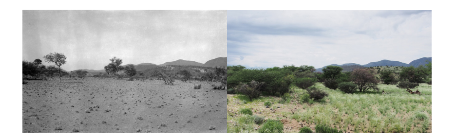
Fig. 16. North Usakos Railway. Savanna transition showing significant increase in woody cover between 1919 (left) and 2014 (right), indicating the influence of a westward shift in summer rainfall.

Species composition in savanna transition sites varied in relation to latitudinal position where the hotter northern sites were dominated by Colophospermum mopane in contrast to southern sites where acacia species predominated.