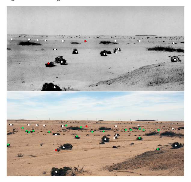
Fig. 14. Fogbelt site near Rössing uranium mine (33km from coast) showing examples of the long-lived shrubs between 1919 (top) and 2016 (below) displaying the same individuals in each image (white dots). The population of this species has doubled during the last ninety-seven years (green dots) due to increased fog. Mortality of individuals is shown as red dots.

The sparse woody cover in the coastal western portion of the Fogbelt (9 km to 35 km from coast) increased by 0.36% per year³ while sites between 40 km to 74 km from the coast showed very little change (+0.003% per year) (Figure 14). Over the study period woody cover declined in only two of the thirteen fogbelt sites, both of which were located towards the eastern margin of this vegetation zone.