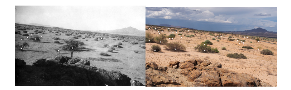
Fig. 15. Grass/shrublands (Aukas East). Matched photographs of Euphorbia damarana , Calicorema capitata shrubland (110km from coast) illustrating slight decrease in cover over ninety-seven years between 1919 (left) and 2016 (right). The replacement of E. damarana by savanna species (white dots) such as Acacia reficiens , A. mellifera , Adenolobus pechuelii , and Maerua parvifolia and Commiphora spp. is indicative of the westward expansion of savanna rainfall.

The average percentage cover of woody vegetation in the grass/shrubland zone was more than twice the average value for the fogbelt zone. Unlike in the fogbelt zone however, woody cover in the majority of sites in the grass/shrublands did not increase over the sampling period (Figure 15). The average change in woody cover was only +0.007% per year. Variability in woody cover change was also relatively low in this vegetation zone. In seven of the eight sites located in the more eastern part of the grass/shrublands (i.e. 92 km to 125 km from the coast) woody plants, more typical of the savanna transition vegetation zone have increased in cover.