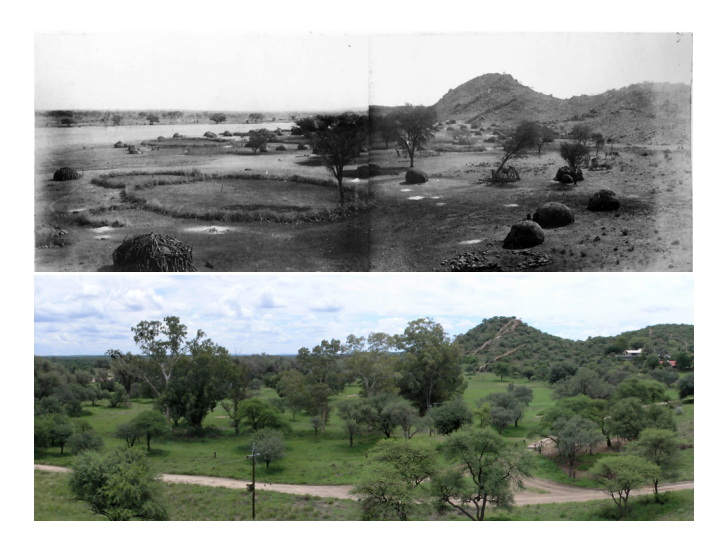
Fig. 8. Maherero's kraal (1876) above, and present day Okahandja (2009) below. Sparse riverine Ana trees and thornveld savanna have been replaced by alien tree species such as eucalyptus (Australian) and prosopis (North American) that now obscure the view of the upper reaches of the Swakop River. These social and environmental changes are emblematic of the reshaping of central Namibian landscapes since colonial times.

inhabiting the territory (Coates Palgrave 1877; Stals 1991). What was then a pastoral scene of grassland savanna with umbrella acacias ( Acacia tortilis ) providing some shade for dung-plastered dwellings and kraaled animals, is now a cluster of twenty-first-century settler houses built like Bavarian castles on high square stone or concrete plinths, surrounded by electric fences and barbed wire. The vegetation changes are astonishing. Where once there was a wide ephemeral river bordering the receding Namibian grasslands (centre left in the top image), there is now hardly an opening in the thornveld canopy. Some of the riverine Ana trees ( Fairdherbia albida ) in the bottom image are now gigantic—like old grandparents care-worn and haggard surrounded by a new generation of hungry dependents. The lush flowering grasses in the bottom image are breast-high in places.