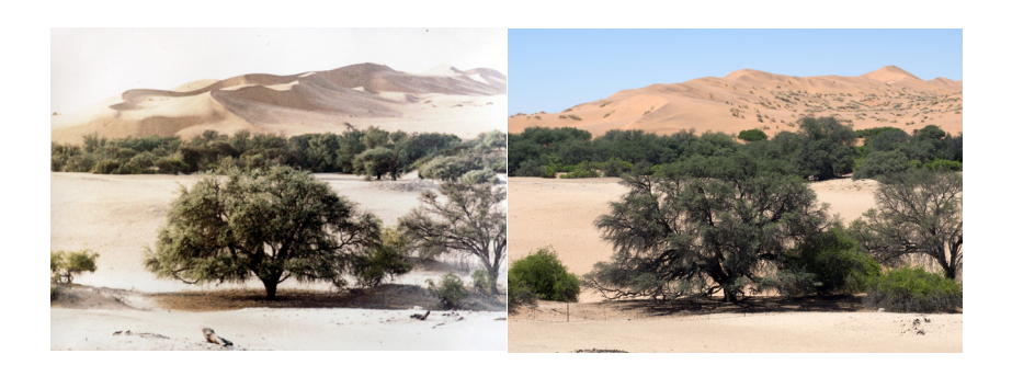
Fig. 17. Large ephemeral river (Kuiseb). Matched photograph from Gobabeb (55km from coast) illustrating significant thickening and size increase of riverine woody cover over fifty years between 1965 (left) and 2015 (right). Dominant riverine species: Faidherbia albida, Tamarix usneoides, Acacia erioloba, Salvadora persica.