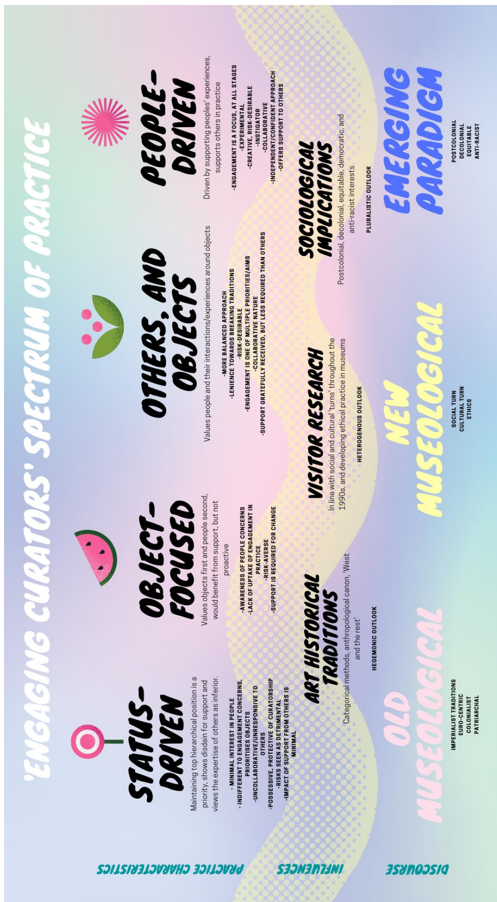
Figure 1. 'Engaging Curators' Spectrum of Practice (Sutherland, J., 2021)