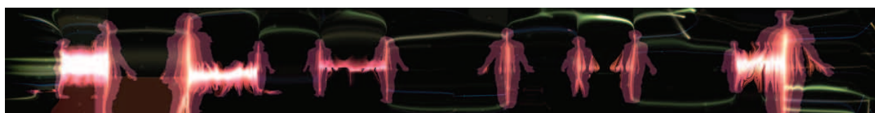
Fig. 5. Single landscape capture of the dome projection taken during a public installation at the dS festival in Bristol.

The entire 360° space can be captured and coupled to the simulation in real time. The resulting visualization is then mapped onto the interior surface of the dome via five projectors. A single landscape image of the entire visualization,