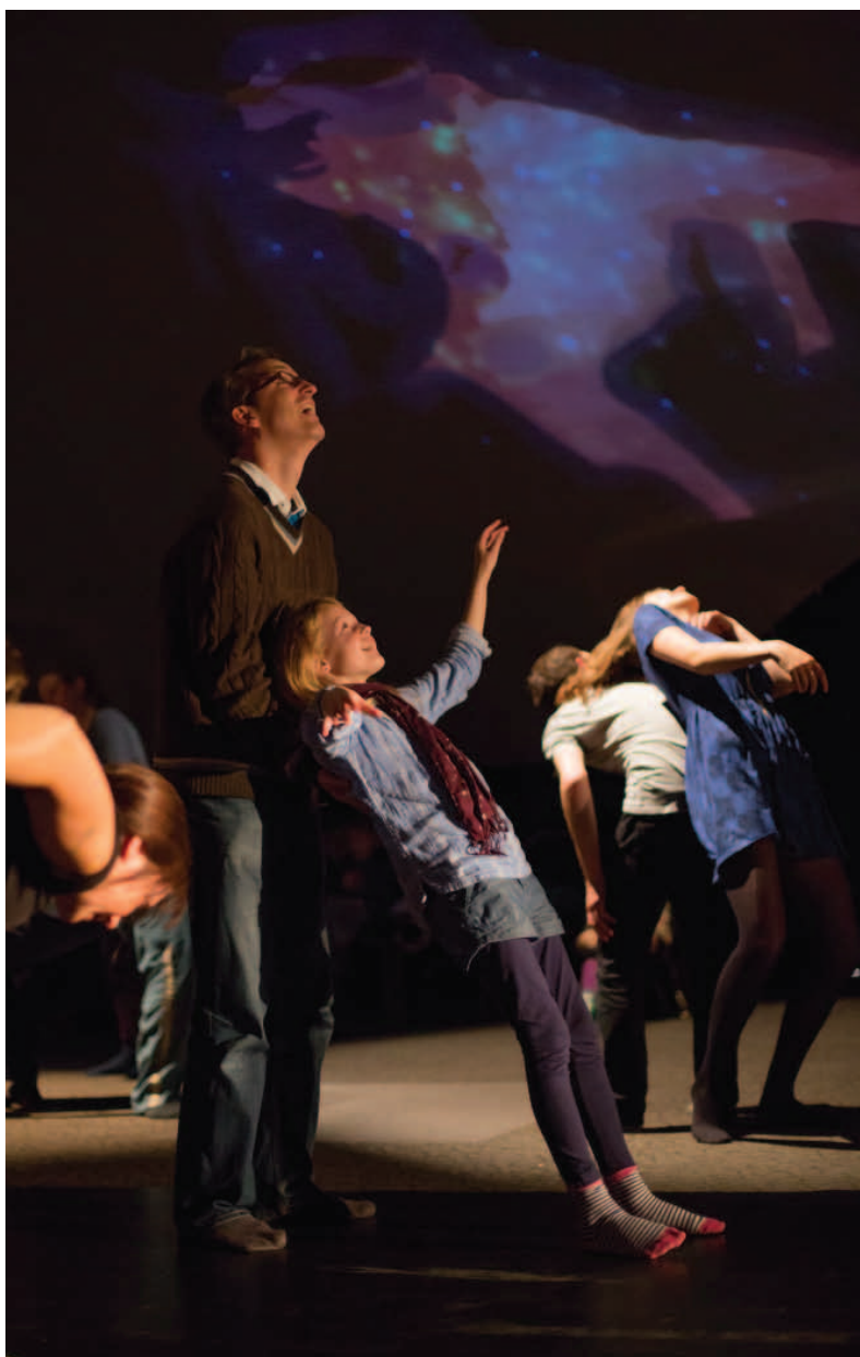
Fig. 3. Photograph taken at a dS public installation at the 2012 Cultural Olympiad.