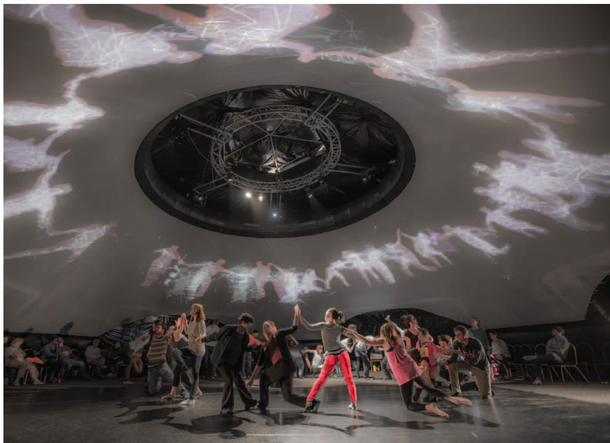
Fig. 4. Photograph of a dance workshop taken at the dS Festival 2013.