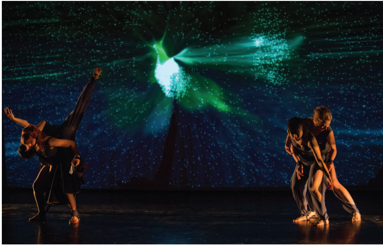
Fig. 7. Photograph of the Hidden Fields performance taken at the 2013 Seeing Sound Symposium.