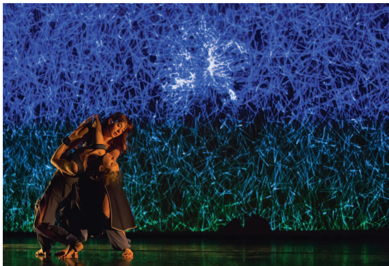
Fig. 6. Photograph of the Hidden Fields performance taken at the 2013 Seeing Sound Symposium.

At a typical Hidden Fields performance, audience members receive program notes containing the above quote along with a brief introduction to the dS system. Following a short verbal description of the underlying science and technology, the 50-minute dance piece begins. At the end, audience members are invited to enter the space and experiment with the system for themselves. Several photographs of Hidden Fields are shown in Figs 6, 7 and the issue front cover).