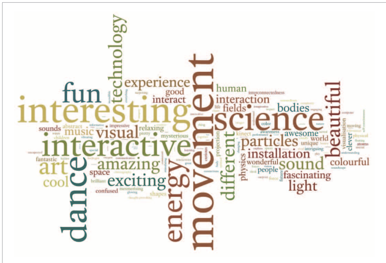
Fig. 8. Word cloud visualizing user feedback obtained from over 250 respondents over three large-scale dS installations. The size of the word corresponds to its frequency in the responses.

danceroom Spectroscopy places no constraints on the number of possible users, and some of the most interesting and beautiful results (graphically and sonically) arise when users undertake collaborative and cooperative action. Users who had seen Hidden Fields appeared to understand this and appeared more willing to cooperate with, and make contact with, strangers. Depth sensor positioning profoundly impacts user-user interaction and corresponding engagement with the dS system. Most often, we place our sensors behind the participants for side-on capture as shown in Fig. 2; however, we have also experimented with ceiling-mounted