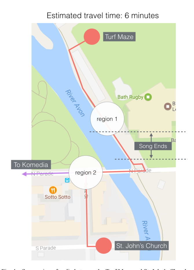
Fig.\ 4.\ \ Sequencing\ of\ audio\ between\ the\ Turf\ Maze\ and\ St.\ John's\ Church