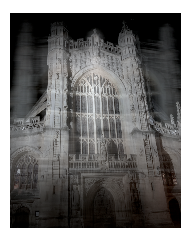
Fig. 3. Still frame of the Bath Abbey scene