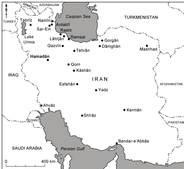
Fig. 1. Location map showing Hamadan in relation to the capital of Iran, Tehran, the high background radiation area of Ramsar and the towns discussed by Hadad et al. (2007).

between elevated areas and the lower plains (Beaumont, 1973; Metz, 1989).