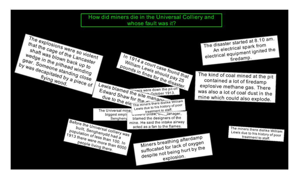
Fig. 2 The SynergyNet Mysteries app with task content used in our trial