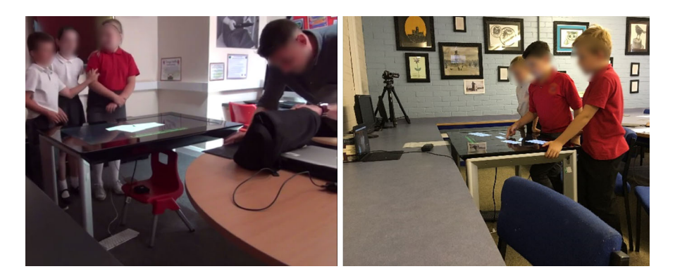
Fig. 1 Groups from school 1 and school 2 facing each other via Skype