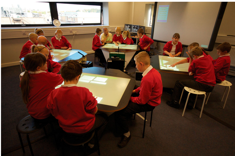
Figure 2. Centered classroom configuration.