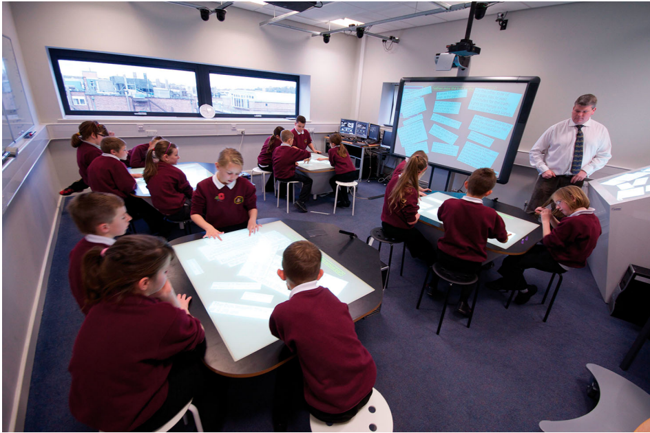
Figure 3. Traditional classroom configuration.

During the first half of the study, the classroom was organized so that the front of the tables were facing the center of the room forming a circle of the tables (see Figure 2 : The centered configuration). For the second half of the study, the front of the tables faced the interactive whiteboard, creating a more traditional classroom environment (see Figure 3 : The traditional configuration). One of the aims of the overarching project was to explore pedagogical and technological designs which ease the transition between teacher-centric and student-centric interactions. Three classes were, therefore, taught in each configuration to allow us to examine if the position of the tables influences how the students interacted during the collaborative activities and whether there were differences in the outcomes of the tasks. As discussed above, previous research on classroom seating arrangements indicated that such changes may indeed influence interaction and task success (Hastings & Schwieso, 1995; Wheldall & Bradd, 2013). A study funded by the Design Council (Woolner, Hall, Wall, & Dennison, 2007a) had noted some of the potential advantages and challenges of a circular arrangement in their exploration of a 360° classroom.