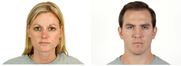
Figure 1. Two examples of the 100 pre-tested photographs retrieved from the Chicago Face Database (Ma et al., 2015) and employed in Studies 1–3.

As a first step, we ran a pre-study to: (1) select 50 photographs each of men and women matched on ratings of competence, dominance, morality, sociability, and attractiveness; and (2) obtain ratings of facial stereotypic qualities to use as independent variables in our studies. We chose the 183 (93 men and 90 women) photographs depicting White faces from the Chicago Face Database (Ma, Correll, & Wittenbrink, 2015), as this is the majority ethnic group in the United Kingdom (where the studies were conducted), and to avoid ethnicity as an additional source of variation (e.g., see Sutherland et al., 2018, on ethnic differences in face perception). The individuals depicted in the photographs had uniformly neutral expressions, and all wore grey t -shirts (see Figure 1).