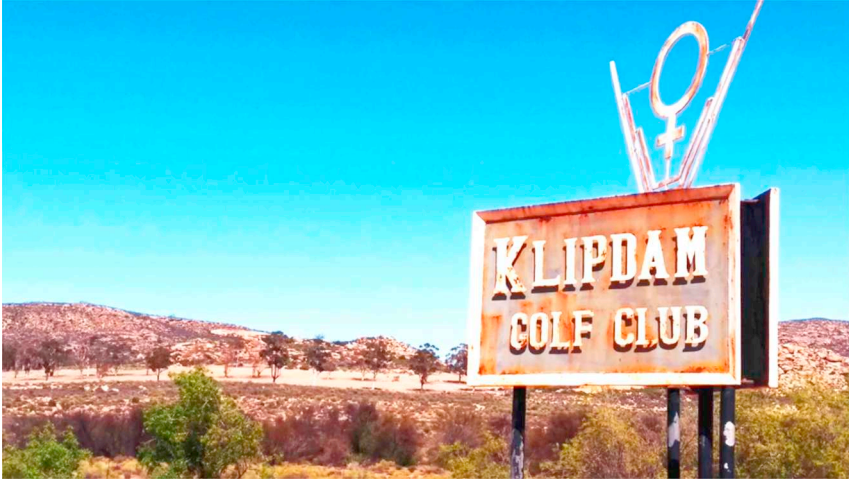
FIGURE 6 In areas like this, mining companies come and go over long periods of time, driven by fluctuations in market prices, technologies, labour costs, tax incentives, environmental regulations and the general compliance (or otherwise) of governments. The last pits in the Okiep area have recently closed, leaving a devastated landscape heritage of spoil heaps, closed mines, emptied towns and unemployed communities. This figure shows an abandoned desert golf club for former local elites, illustrating how the landscape of ruination has become a heritage of both the inequity and limited sustainability of mining ventures.