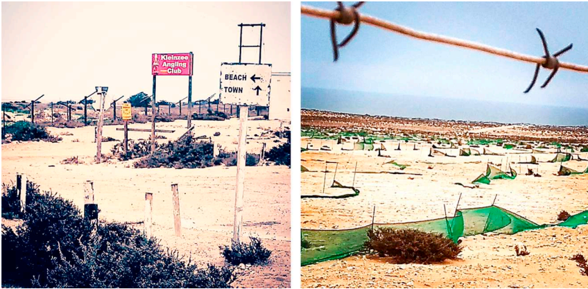
FIGURE 4 Not far beyond Brand se Baai, excavations and spoil heaps appear whose scale and extent dwarf the ilmenite workings. The next 500 miles of coastline have been massively reshaped by over a century of diamond mining. At Oranjemund, just north of the Orange River, decades of digging have pushed the Atlantic Ocean back hundreds of metres behind giant walls of sand and concrete, allowing the shoreline to be excavated down to the bedrock where diamondiferous gravels are found. These land operations are now winding down as the focus shifts to marine mining, leaving semi-abandoned towns such as Kleinsee (left) set in vistas of green plastic fencing purporting, as at Brand se Baai, to shelter re-establishing desert flora (right).