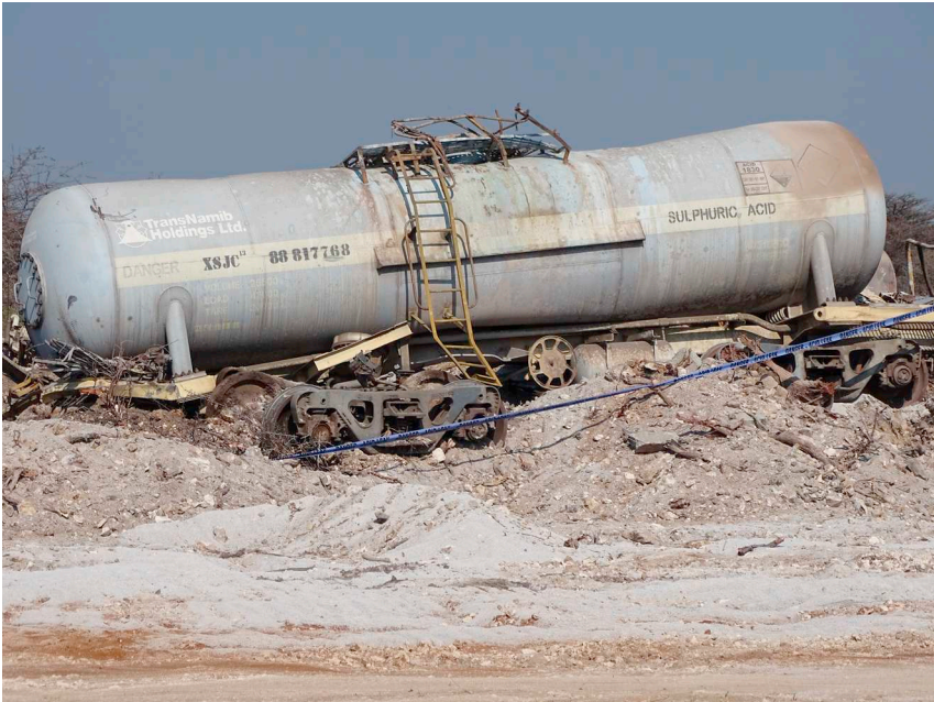
FIGURE 8 The Tsumeb copper smelter in northeast Namibia is owned by Canadian company Dundee Precious Metals (DPM). Originally serving a now-closed mine, it specialises in producing copper from ore containing high levels of arsenic and sulphur, a process banned in many countries on environmental grounds and thus indicative of the global displacement of environmental harms. It processes around 250,000 tonnes of copper ore concentrate a year, half of which is imported from a DPM mine in Bulgaria, the rest coming largely from Chile and Peru. Arsenic trioxide is stockpiled in the open air and sulphur is processed into sulphuric acid, shipped by train to Rössing, for use in leaching uranium ore. Derailements of these acid trains, as shown in the figure, can lead to major toxic spillages (see eg Simiyasa 2022), leaving legacies of post-extractive waste rather than wisdom that ‘sits in places’ (Basso 1996; Baird 2022).