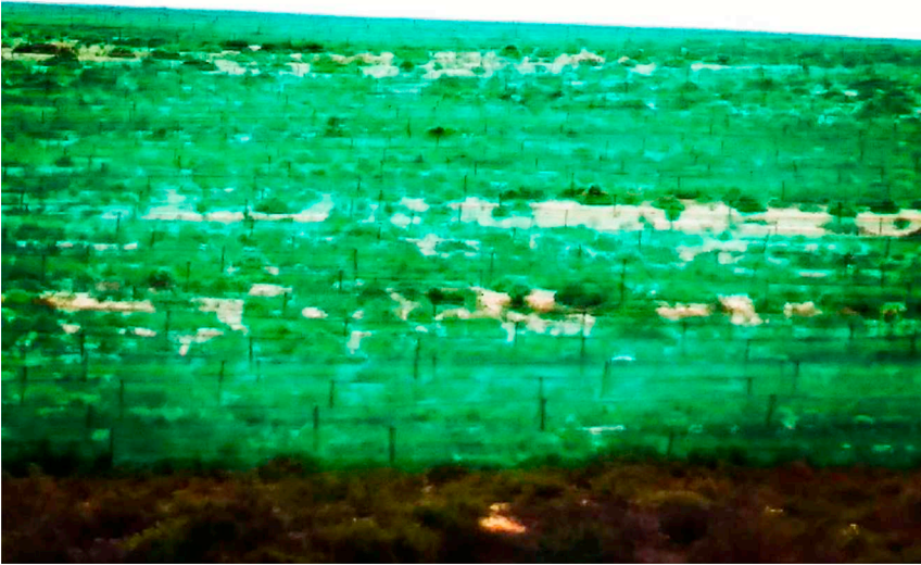
FIGURE 3 Aware of environmental impacts, the companies attempt to ‘rehabilitate’ mined areas. Miles of green plastic netting, intended as windbreaks to encourage re-establishment of vegetation and invertebrate biodiversity, instead become a new layer of toxic heritage and environmental harm. An environmental officer for one of the Brand se Baai mines told us, however, that few previously existing species have yet returned, nonetheless sharing their belief that ‘Mother Earth’ (their words) is very forgiving of destruction caused by mining.