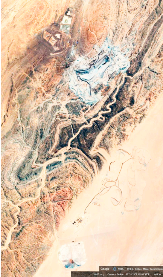
FIGURE 9 Namibia is one of the world's top five uranium producers. Owned since 2019 by China National Uranium Corporation, the Rössing uranium mine in the Namib desert (above) has produced more uranium than any other mine in the world. It was opened in 1976, while Namibia was controlled by apartheid South Africa. Just across the ephemeral Khan River is the Husab uranium mine (below), also majority-owned by China. When opened in 2017, Husab represented the single largest Chinese investment in Africa. As well as sulphuric acid and other chemicals, processing uranium ore into 'yellowcake' (the basis for nuclear reactor fuel) requires electrical power (produced mainly by diesel generation) and enormous volumes of water, piped into these desert mines from a desalination plant on the coast. Biodiversity offsetting is again proposed to mitigate the legacy of environmental harms caused by these processes (Sullivan 2013), although it is unclear how these practices can offset the radioactive future heritage entangled with uranium mining.