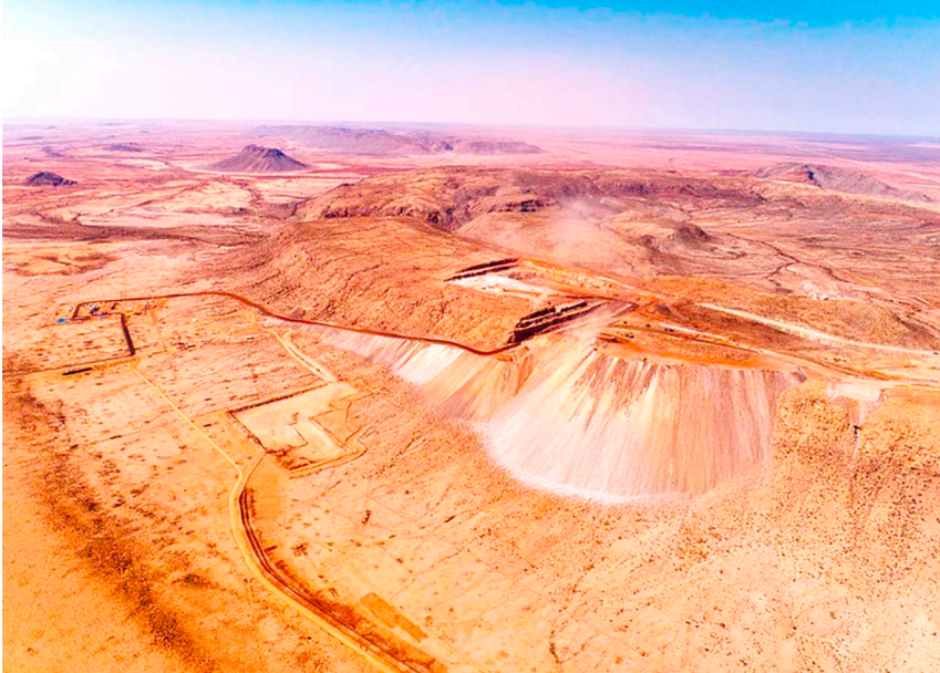
FIGURE 7 The nearest current mining boom to Okiep is happening a hundred miles east near Aggeneys at the recently opened Gamsberg zinc mine, whose Indian owners Vedanta hope to extract 214 million tonnes of ore over a 30-year period. This figure shows an aerial view of Gamsberg in mid-2017. 2 The Gamsberg mountain sits within the Succulent Karoo Biome, one of the world's 36 'biodiversity hotspots'. Vedanta's mine is hollowing out this spectacular inselberg, the acknowledged core of the Critical Biodiversity Area identified in the Namakwa District Bioregional Plan and thus an area central for sustaining biodiversity heritage. Toxic for biodiversity, such impacts will allegedly be 'offset' by enhanced conservation of similar habitats nearby. Under these offsetting plans Vedanta will take control of further large areas of land in the area (Hughes et al. 2015), but how effectively these areas will themselves be protected from future mining remains unclear.