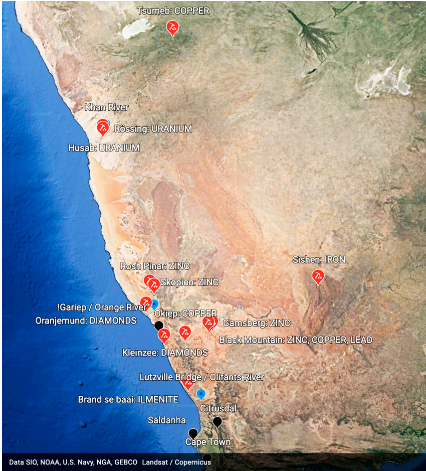
FIGURE 1 Mining sites mentioned in the text.