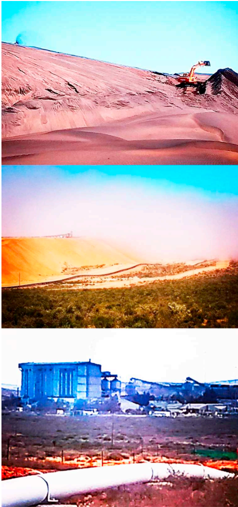
FIGURE 2 Ilmenite mined from fog-shrouded coastal sands around Brand se Baai near the Olifants river mouth produces titanium dioxide, a brilliant white pigment used in products from paint and paper to toothpaste and sunscreen. Operated by US company Tronox and Australian firm Mineral Resource Commodities, a legacy of environmental harm is created as large areas of sandy coastal habitat are excavated to access underlying heavy mineral sands, which are then processed by acid leaching.