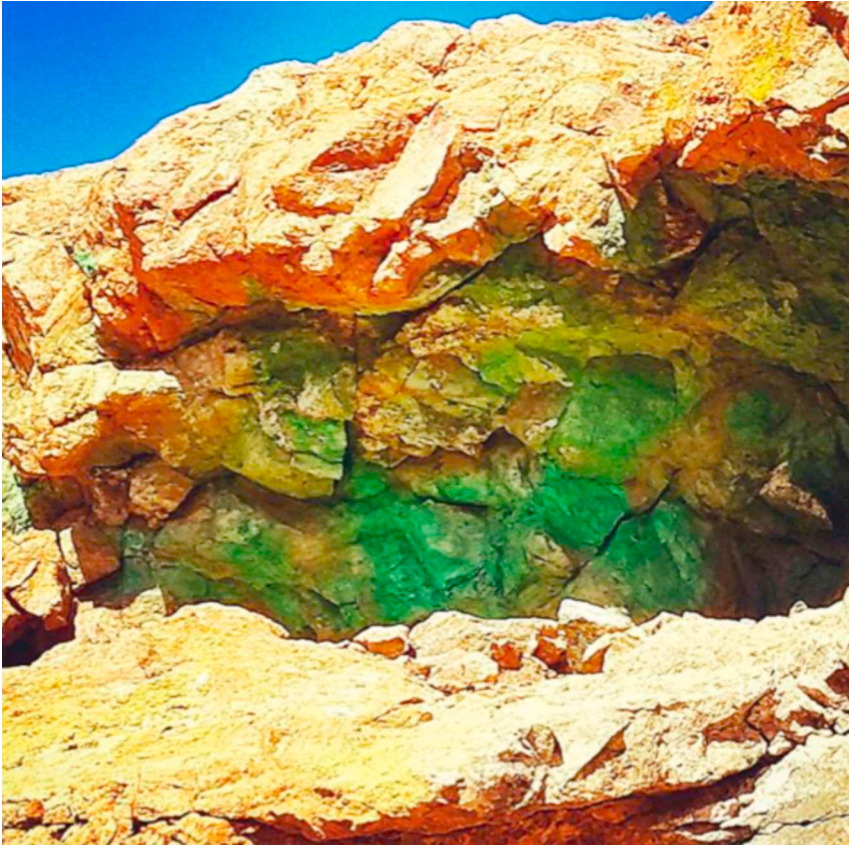
FIGURE 5 Van der Stel did find copper in the Northern Cape. This picture shows his exploratory diggings, burrowing into a rocky outcrop that is indeed remarkably green. In the 1850s, with the Cape Colony now under British control, high-grade ores were found nearby, and Okiep, near Springbok, eventually became ‘the richest copper mine in the world’, causing immense environmental excavation and landscape reshaping.