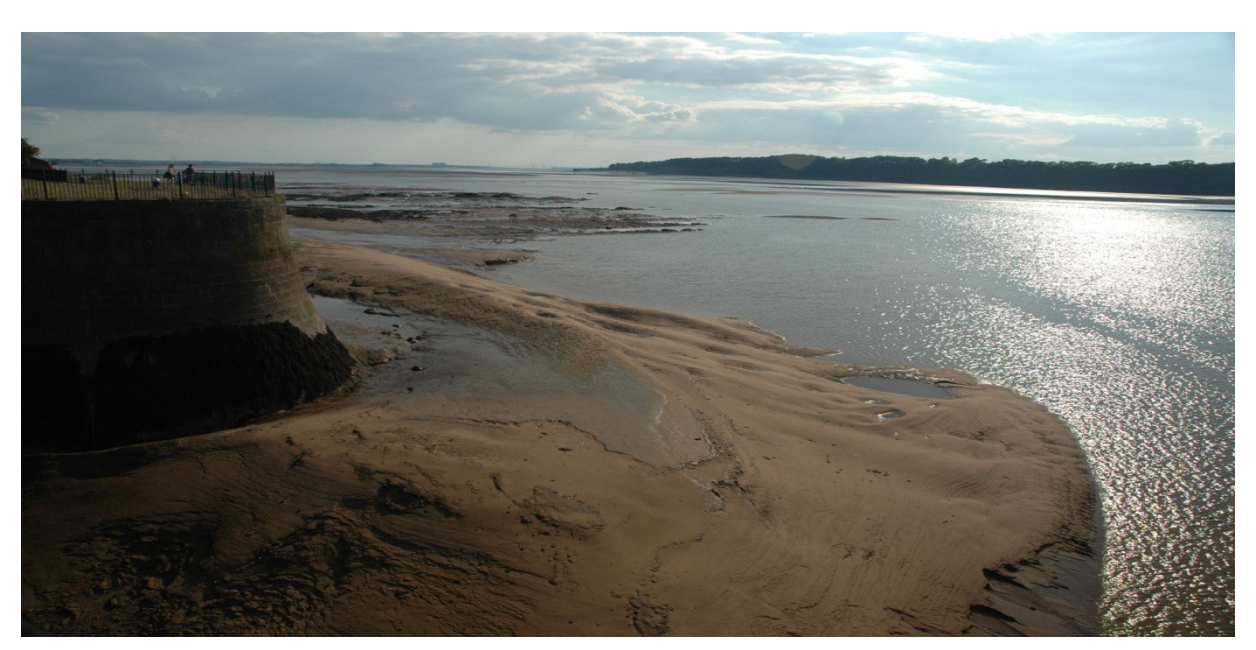
Figure 1. Low tide, Sharpness docks, Severn Estuary. High tide will take the water level to the very top of the wall. (Note the figures for scale)

This highly dynamic, powerful process presents huge challenges to processes of local government and environmental management. As the Severn Estuary Partnership (SEP) put it;