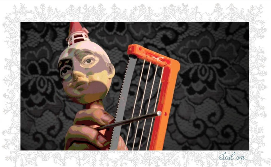
Figure 1. The Land of Lace screenshot. Image created by Jo Lawrence.

The Land of Lace is altogether more unified than the other islands, and is intended to feel more like a 'conventional' aria that sets the ten evocative images, derived from Aubrey Beardsley, in Jarry's (1996, 35 – 36) description. It is through-composed by Andrew Hugill and consists of ten vocal lines that may be substituted one for another, each in two versions, one English and one French, thus giving the user a choice of languages. Each of these ten lines is set to one of ten possible accompaniments, scored for flute, organ, harmonium, piano, celesta, glockenspiel, harp, harpsichord and untuned percussion. The combination of instruments in each line is determined by a Greco-Latin bi-square, with two 'active' instruments and two 'passive'. These roles imitate the behaviour of the four bobbins in bobbin lacemaking. As it works through the ten lines, the music gradually becomes more harmonically complex and decadent in style. The Syzygy Surfer performs numerical operations to determine a route through the accompaniment that ensures the