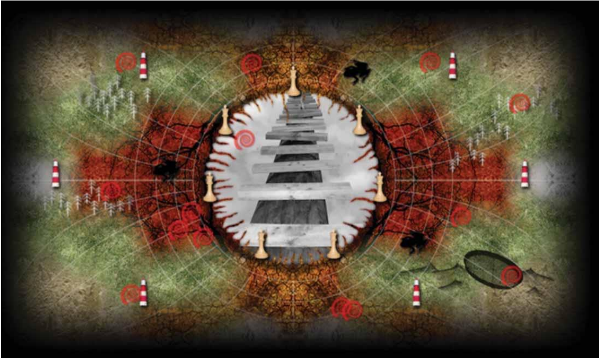
Figure 2. Quincuncial projection of The Amorphous Isle.

musical language evolves as intended. The Syzygy Surfer is also used to navigate the visual material of The Land of Lace, which is created by Jo Lawrence and inspired by images from Jarry, Beardsley and patterned lace, that progressively becomes more intricate over time (Beardsley 1967).