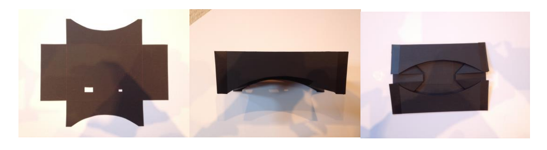
Fig 1. Template