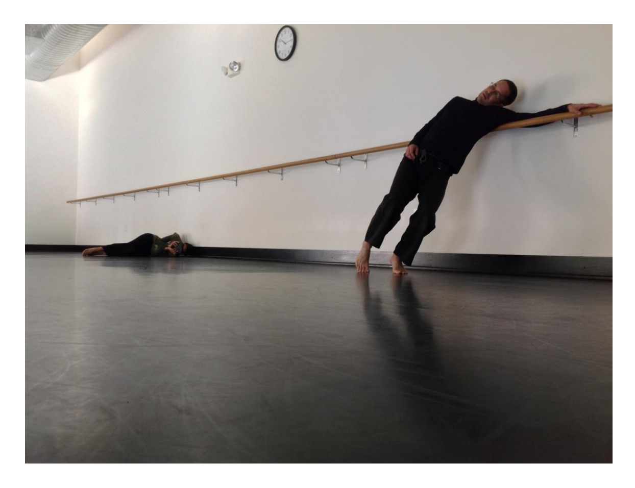
A Different Way of Looking. Workshop. Mills College, Oakland, California.

More stills with workshop music can be found at: http://youtu.be/u-yi6F6XYsM