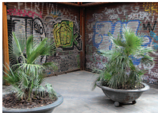
Figure 2b: Shopfront shutters adorned with graffiti in the Barri Gòtic.