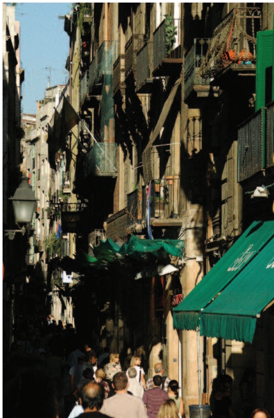
Figure 8: Carrer de la Boqueria in the Barri Gòtic Quarter of Barcelona.