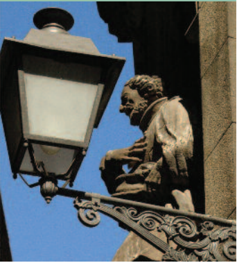
The Barri Gòtic Quarter of Barcelona.