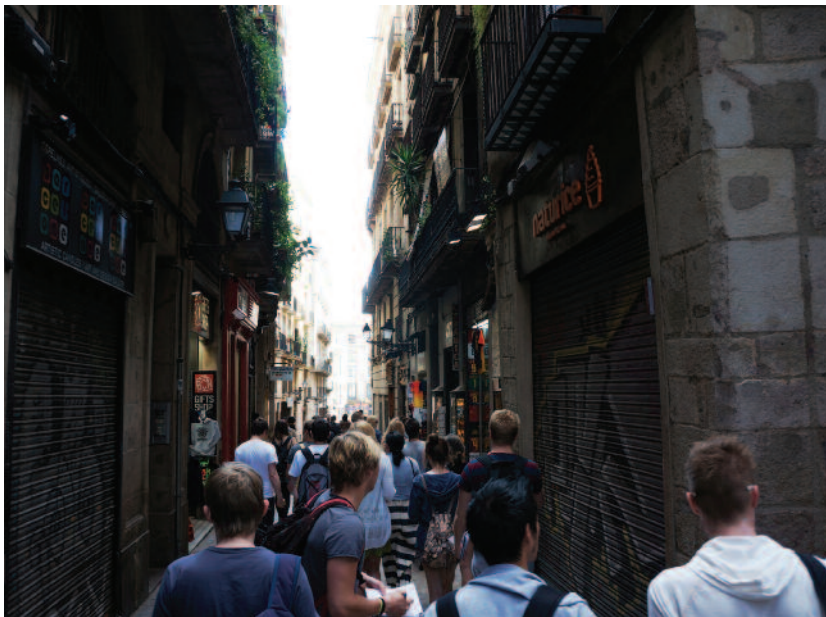
Figure 2a: The Carrer de la Llibreteria in the Barri Gòtic Quarter is typical of the narrow streets filled with shops and museums.

were closed and their frontages were protected by metal shutters adorned with graffiti (Figure 2b). This can profoundly affect a sense of place as sometimes the visitor's experiences can be overwhelmingly positive, or somewhat negative. Guide books often portray this area as an open-air 'mediaeval' or 'gothic' quarter. While the Barri Gòtic (Figure 3) may appear to be mediaeval or gothic, nowadays it cannot be described of as thirteenth-century. Instead, the buildings were constructed during the nineteenth and twentieth centuries in the neo-gothic style. During the nineteenth century, some of the original gothic buildings were removed and more contemporary buildings were added in their place. These more modern buildings are more functional than aesthetic, but their juxtaposition with the older buildings provides a sense of an 'organic' or 'natural' evolution of the area. Unravelling the palimpsest reveals that original buildings have been altered, sometimes demolished, or moved, and existing buildings may look older than they really are. The area contains some medieval buildings – notably the Santa Maria del Mar, Plaça de Sant Just, Palau de la Generalitat de Catalunya (Carrer del Bisbe side, 1418) (Figure 4) and Carrer del Montcada (rich merchants' houses) located outside of the core area of the Barri Gòtic – yet other features (such as the enclosed gothic bridge