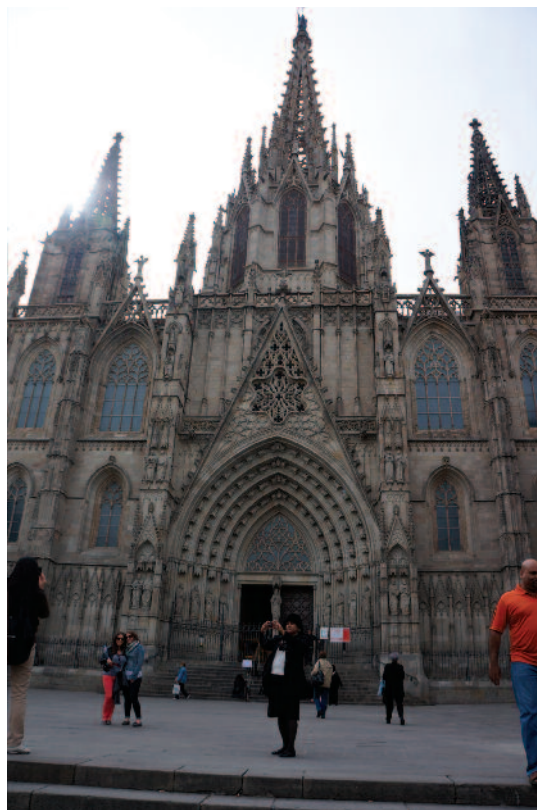
Figure 5: The nineteenth-twentieth century façade of the Catedral de la Santa Creu i Santa Eulàlia.