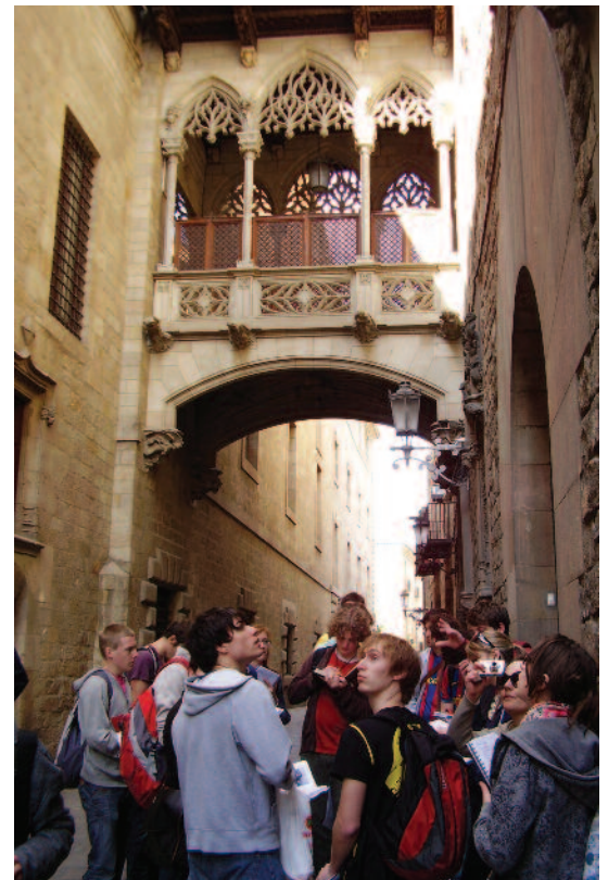
Figure 3: Students beneath the 'gothic' bridge over the Carrer del Bisbe within the Barri Gòtic Quarter.