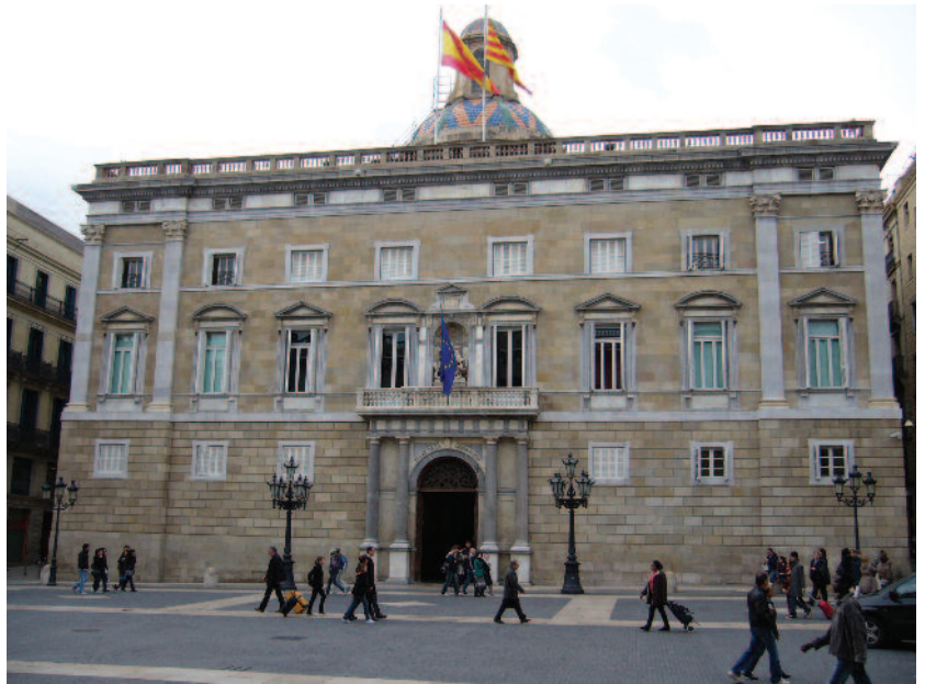
Figure 4: Palau de la Generalitat de Catalunya: one of the few original medieval buildings in the Barri Gòtic.

Unravelling the geographical palimpsest through fieldwork: discovering a sense of place